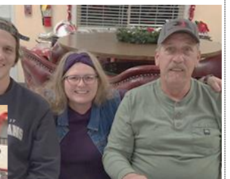
Post Christmas Dinner 2023