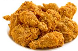
Fried Chicken Dinner 1800 - 2000