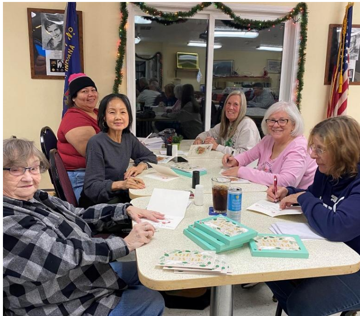
December 13 th Post 604 Christmas Pitch-in – Cancelled