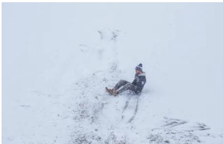
To avoid the risk of scenes like this.